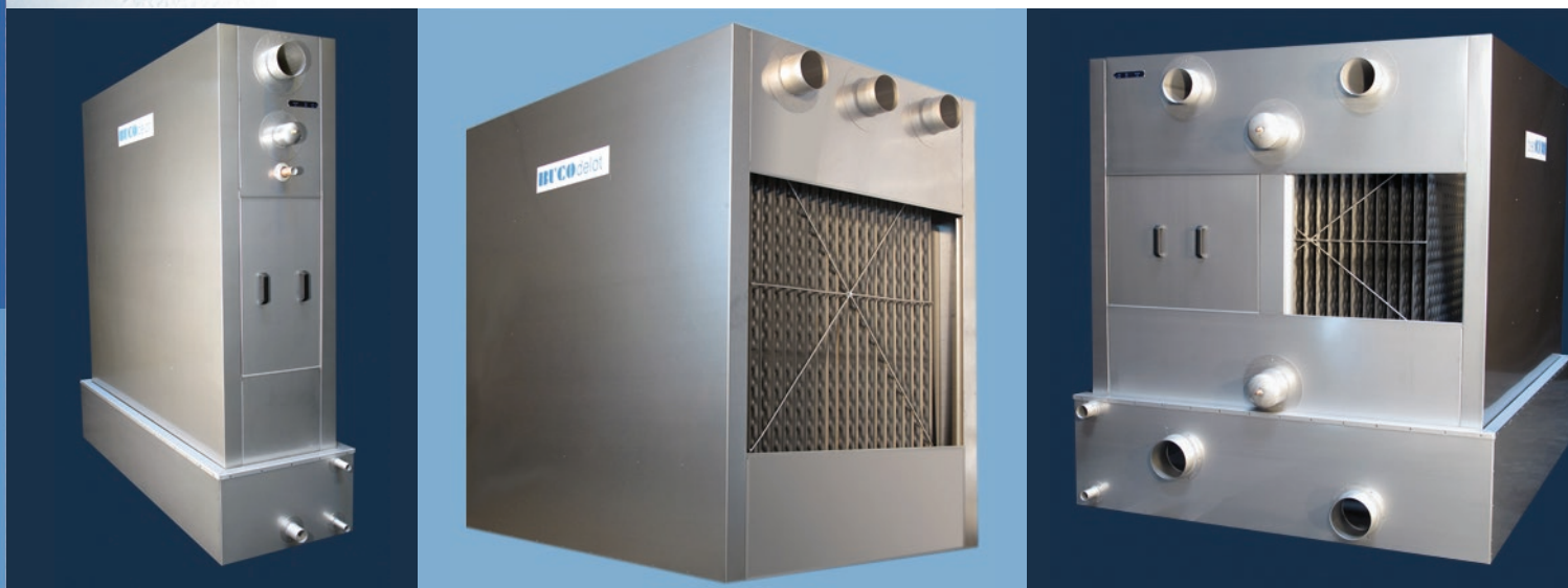
PIC LEFT TO RIGHT BUCOdelot compact system with tank, power 100 kW - dx; BUCOdelot typ M, power 1000 kW; BUCOdelot typ B, power 2000 kW